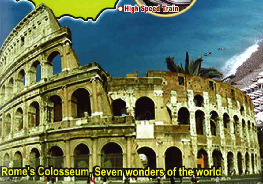
Rome's Colosseum, Seven wonders of the world